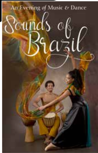
September 23 & 25 Opperman Music Hall

THE TALLAHASSEE BALLET 2022-2023 50th ANNIVERSARY SEASON