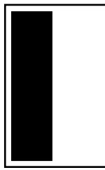
½ Vertical 2.15" x 7.5"