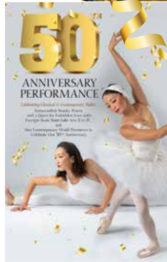
May 13-14 Ruby Diamond Concert Hall