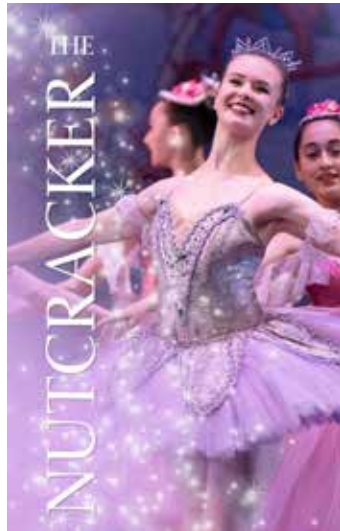
December 10-11 Ruby Diamond Concert Hall