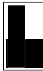
1/2 Vertical 2.15" x 7.5"