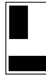
1/4 Vertical 2.15" x 3.35"