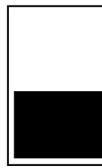
½ Horizontal 4.5" x 3.35"