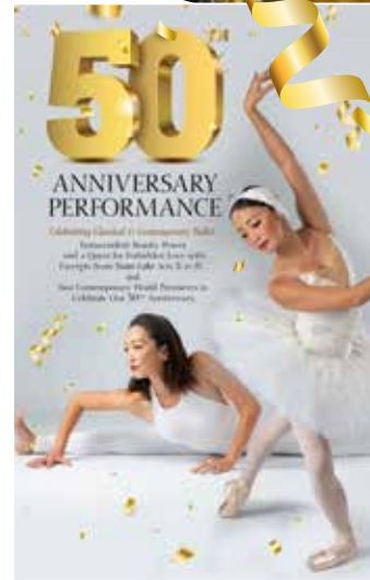
May 13 Ruby Diamond Concert Hall