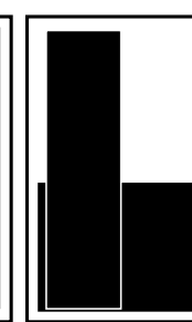
1/2 Vertical 2.15" x 7.5" 1/2 Horizontal 4.5" x 3.35"