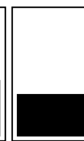
1/3 Horizontal 4.5" x 2.5"