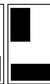
1/4 Vertical 2.15" x 3.35" 1/4 Horizontal 4.5" x 1.75"